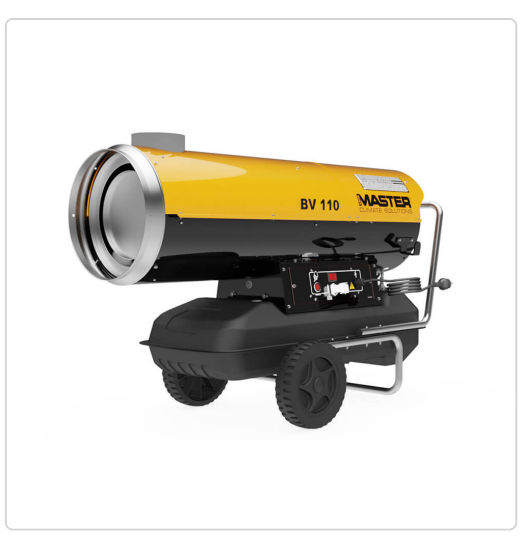
Master BV 110 - indirect oil fired air heaters