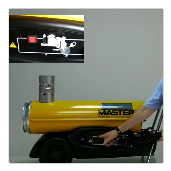
Master BV 77 oil fired indirect air heater