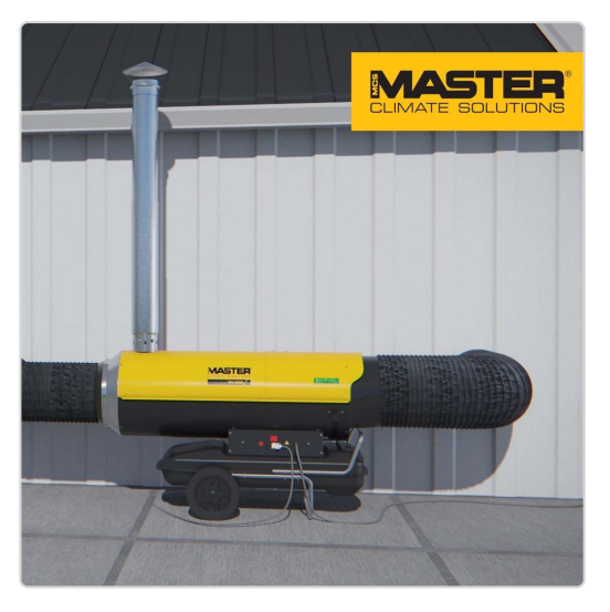
Master BV heaters air recycling video