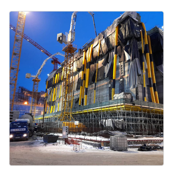
Master BV 290 construction site