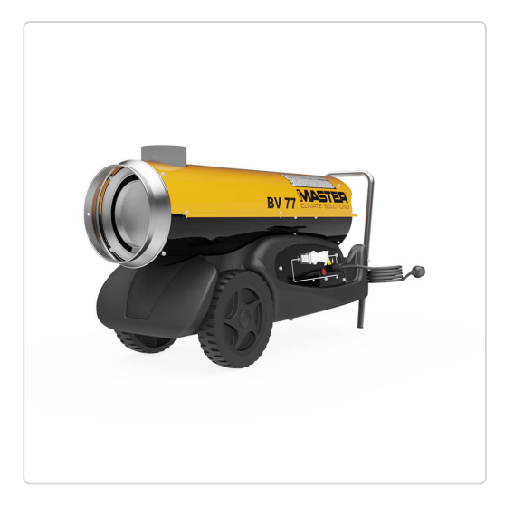
Master BV 77 – indirect oil fired air heaters

Master indirect oil heaters are highly efficient and generate 100% clean, dry and fume-free warm air. They are ideal for places with limited ventilation like shops, event tents, food preparation areas or exhibition halls. They can be used with flex hoses to distribute the warm air.